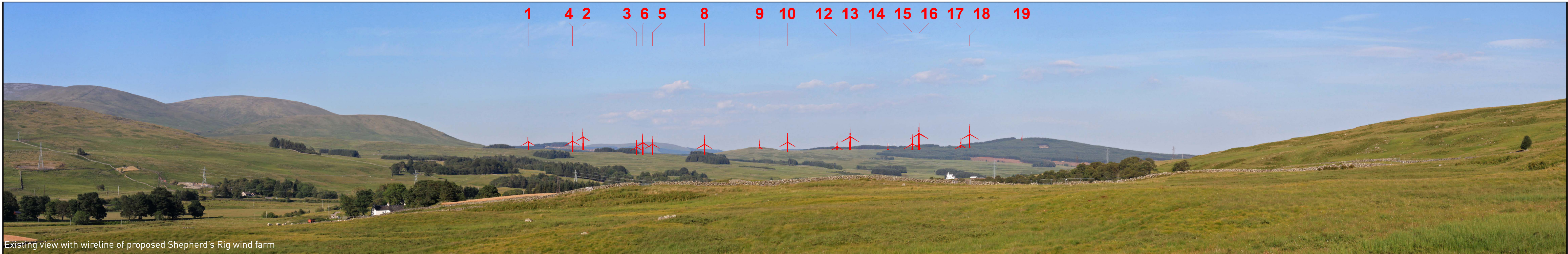
Existing view with wireline of proposed Shepherd's Rig wind farm